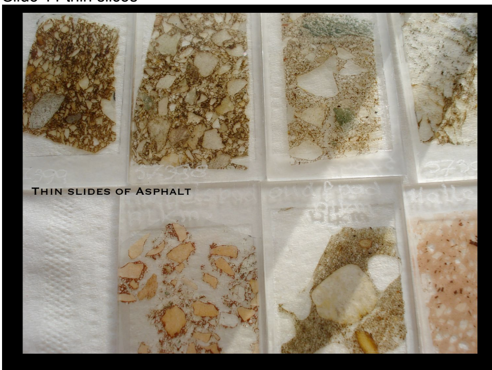
Slide 11 thin slices

the bent spoons and forks, sounds, movies and pics of asphalt and a small scale model of the radio station presented here in our installation.