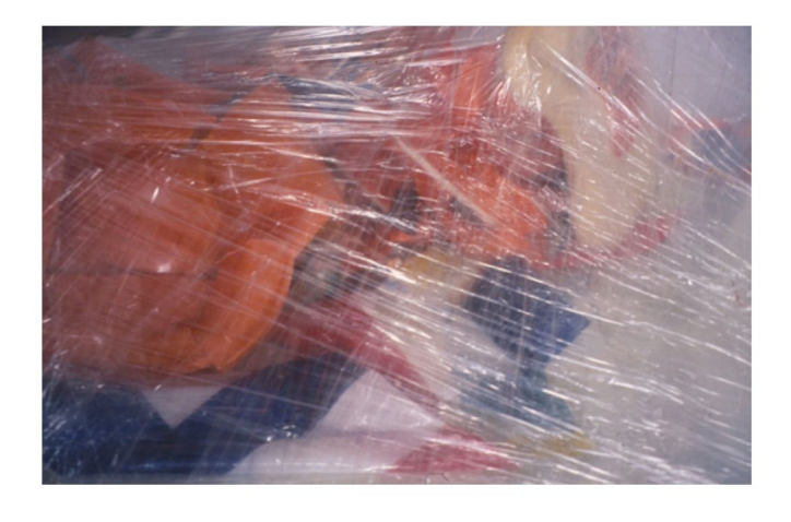
Dutch Bruto National Public Waste Product - part of sample 3

The waste in the United States is larger per item than European waste.