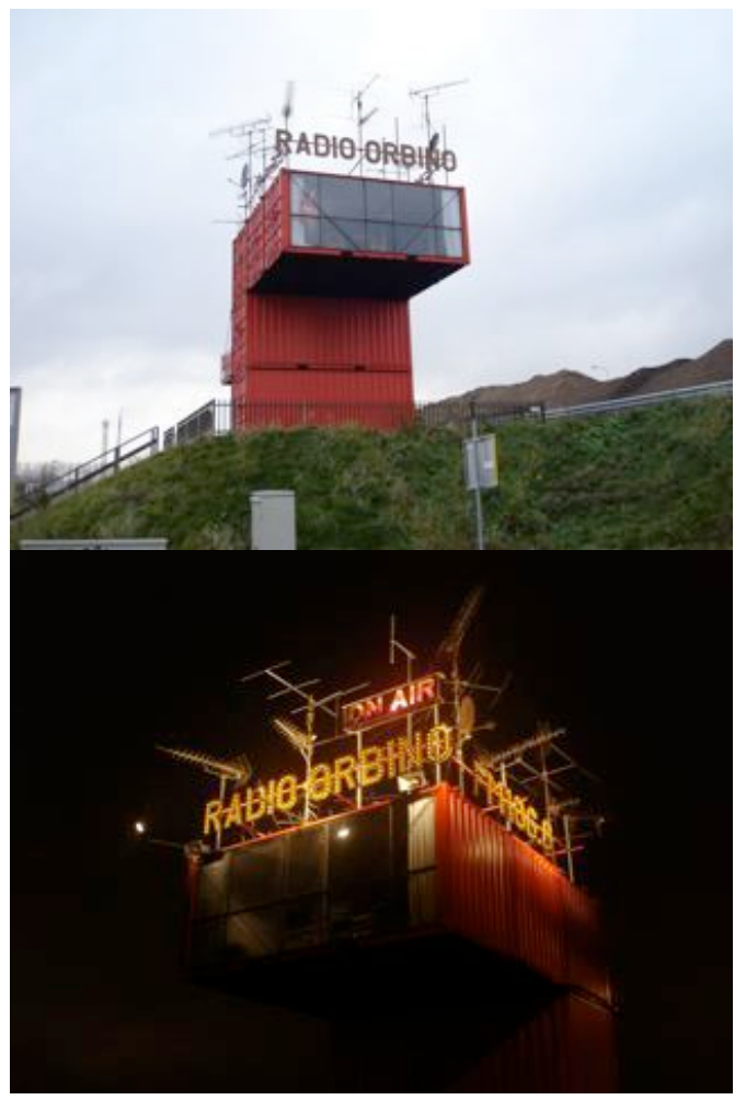
Last slide with radio orbino

To find out more about the artwork and the relation to intra active agencies and agential realism, you will find an article about the project on the palcom site