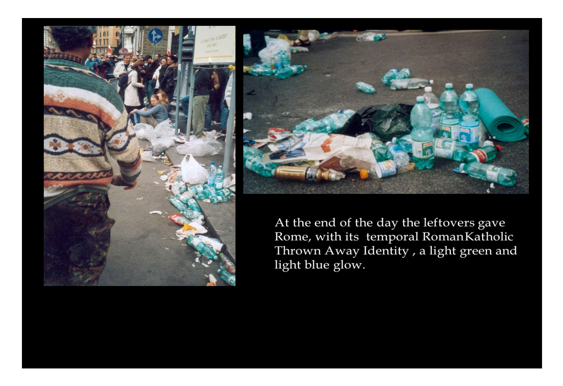
Slide 6 roman katholic waste scape

In New York I sampled what spectators, staring at the WTC crater had thrown away. Slide 7 sampling New york