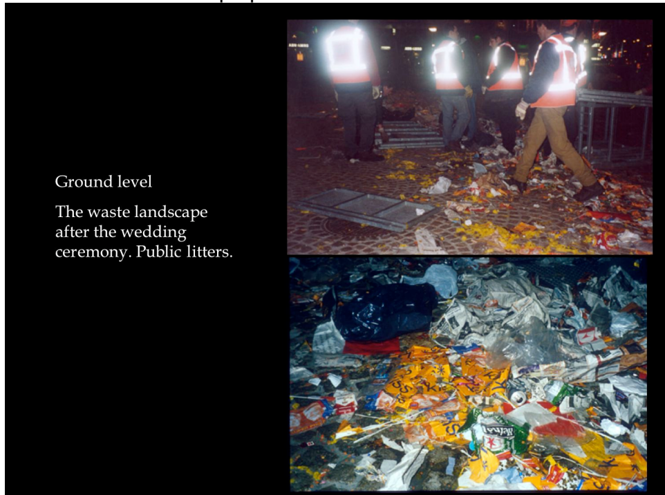
Slide 3 waste landscape public waste

The public part was a wave of garbage consisting of orange and red-white-and-blue flags and bits of paper, orange coasters, orange shish kebab skewers, orange crowns, orange balls, orange chairs, news papers and plastic bags that had gathered against the fences.